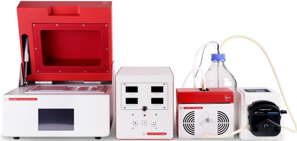
The X-CLARITY™ Systems

In principle, the CLARITY method is the most compatible for FP imaging, but having to construct one's own electrophoresis chamber with a makeshift cooling system to prevent overheating is a challenge to most.