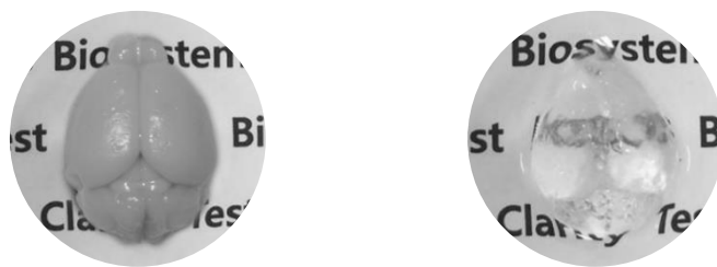
A whole adult mouse brain before (L) and after (R) clearing with the X-CLARITY™ systems and reagents

The procedure described here is a step-by-step protocol to obtain images of endogenous FP signals from transparent mouse brains. As demonstrated here, the Thy1-YFP signal is well-preserved after clearing with the X-CLARITY™ systems and reagents for tissue clearing. The signal was found to be stable even a month after the sample was cleared. The X-CLARITY™ Tissue Clearing System has an ETC chamber with platinum-plated electrodes that generate a dense and stable electric current, resulting in remarkably fast clearing times and consistent clearing. This combined with the integrated cooling system effectively preserves the fluorescence signal of endogenous FPs, allowing for volumetric imaging of large samples at single-cell resolution for improved data quality.